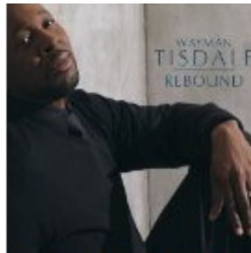
Rebound (Dlx) (Dig) [2008]

The amazing thing is that if Wayman had stayed in the basketball world, we would not have known the music from him that is ingrained in us today. Staying in basketball was truly an option as he succeeded in the Big Eight Conference Player of the Year and the first player in collegiate history to be named a first-team All American by the Associated Press in his freshman, sophomore, and junior seasons. [7] He still holds the record at Oklahoma for the most points scored by any player through his freshman