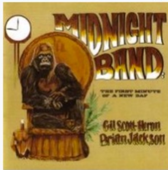
Studio album by Gil Scott-Heron & Brian Jackson