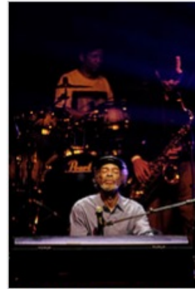
Scott-Heron performing at the Regency Ballroom in San Francisco, 2009

I remember checking on-line for Gil and discovered he had just been released from jail about a month prior. Later in April 2009 on the BBC, poet Lemn Sissay presented a half-hour documentary on Gil Scott-Heron entitled Pieces of a Man . Later he was back on the circuit, but it was not the same. His body and words carried the look and sound of beat down. I believe he summed it all up with his album Me And The Devil . There was no doubt a toll was taken, but in the spirit of survival, Gil kept going as best as he knew how.